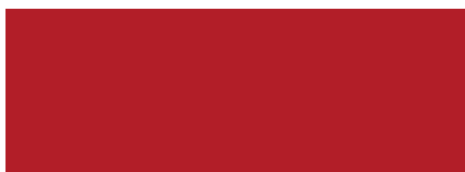
Red - Pantone 7621 C