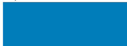
Royal - Pantone 7641 C